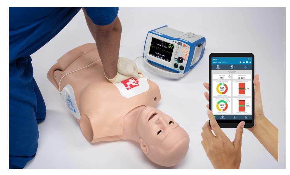
Give real-time feedback on CPR quality, or use coaching mode to learn

Whether for outreach or professional development, the new HAL S315.600 is a great addition to every basic life support algorithm training curriculum. Train learners on assessing breathing, performing quality CPR, delivering a shock, and recognizing return of spontaneous circulation. HAL offers a portable, all-in-one resuscitation training solution for every training need.