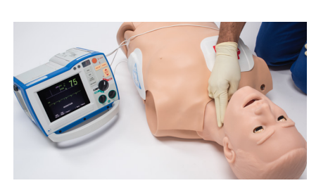
Check for return of spontaneous circulation