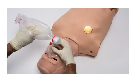
Visualize realistic chest rise with BVM ventilation